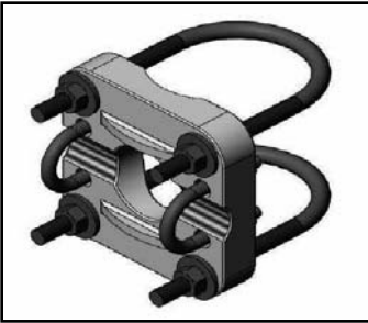
BWC1001 yagi clamp, fits mast of 0.5" - 0.84" OD