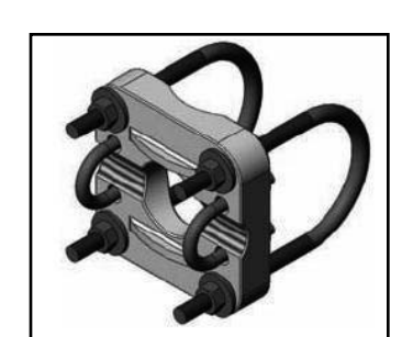
BWC1001 reversible U-bolts fit pipe mounts 1.25" - 2.4" OD